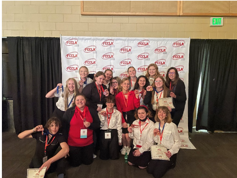
FCCLA ROCK IT AT STATE!